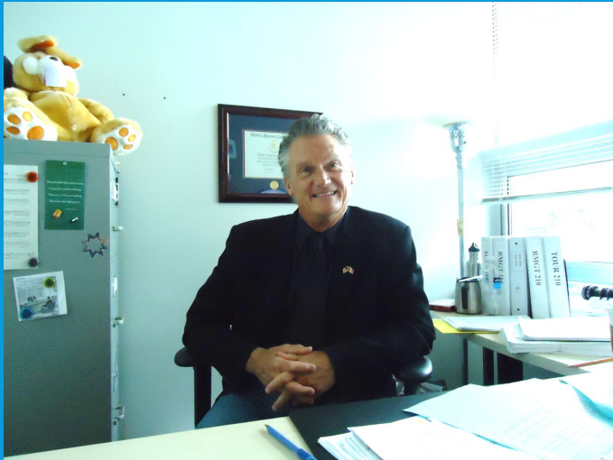
Vancouver Island University (VIU)