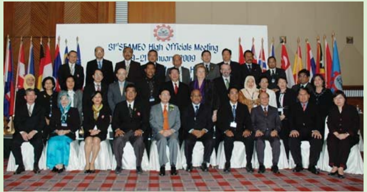
Heads of delegations of SEAMEO Member and Associate Member Countries, directors of SEAMEO regional centres and representatives from international organizations in a group photo with HE Mr Jurin Laksanavisit, Minister of Education, Thailand

The 31 st HOM endorsed the proposal for presentation at the 44 th SEAMEO Council Conference (April 2009) for approval.