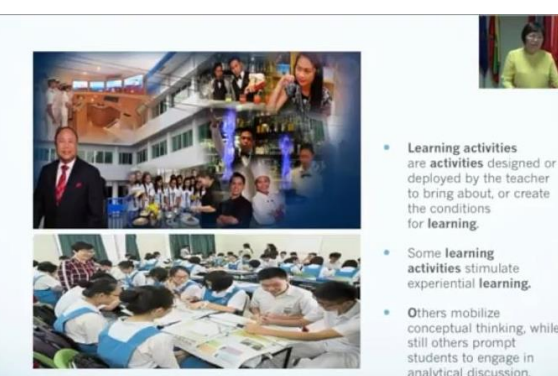
Principle1. Leadership for learning practice involves maintaining a focus on learning as an activity.

The coming Cyber Learning Program will be continued in this August and targets basic education teachers. For further information, please visit the website http://cyberlearning.vnseameo.org/, get information and join the courses.